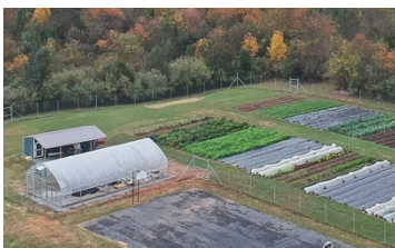
Farm at Berkley Glen Elementary School