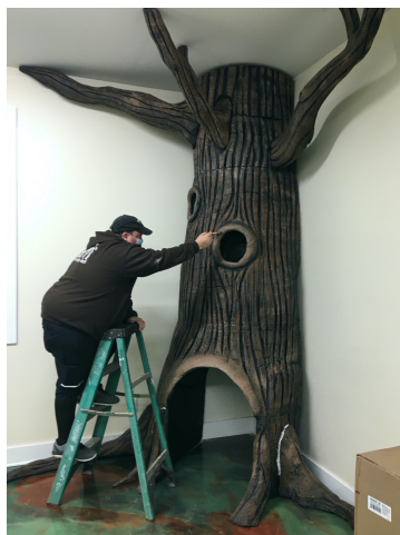
Finishing up the tree