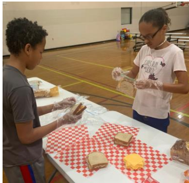
Children of essential workers in YMCA childcare pack lunches for the homeless