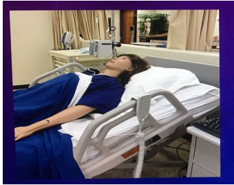
Juno can be programmed to simulate a variety of health conditions