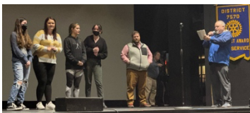
WHS Interact Club