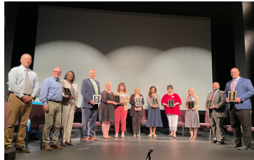
Waynesboro School Administrators